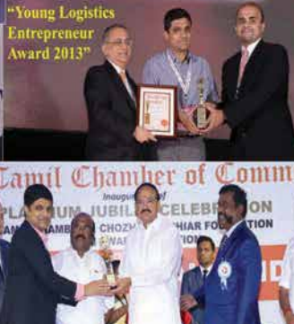
"Young Logistics Entrepreneur Award 2013"