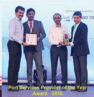
Port Services Provider of the Year Award - 2016