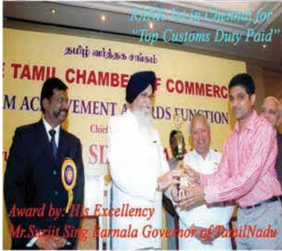
Award by: His Excellency Mr. Surjit Singh Barnala Governor of Tamil Nadu