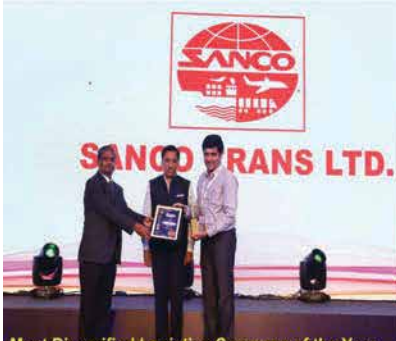
Most Diversified Logistics Company of the Year Award - 2018