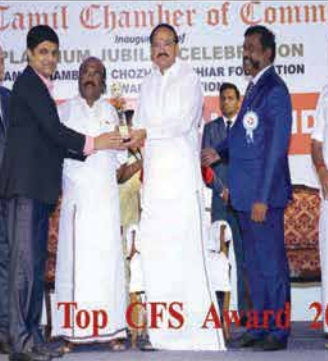
Top CFS Award 2018