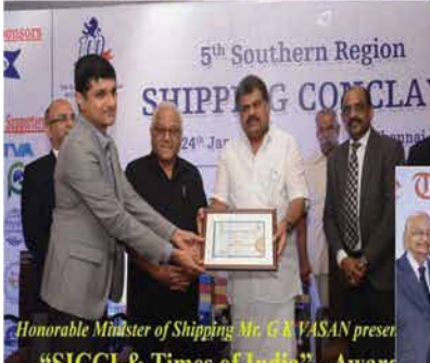
Honorable Minister of Shipping Mr. G. R. VASAN presents "SICCI & Times of India" - Award