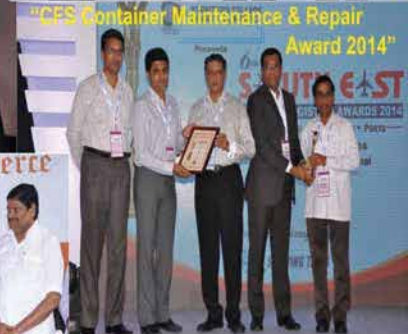
"CFS Container Maintenance & Repair Award 2014"